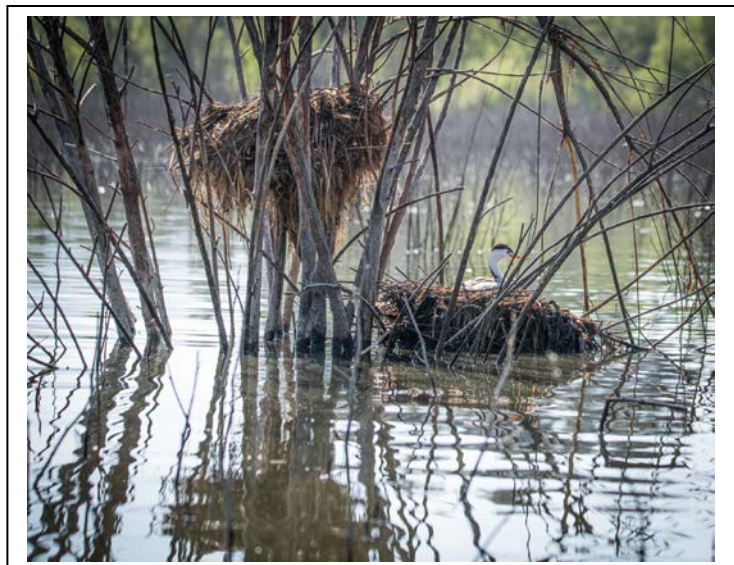
Fig. 1. Nests and eggs left high and dry by SDCWA. Nests filled with eggs, like the one shown high above the water line, failed as a result of SDCWA pumping. The nest could not be reached by the parents. Consequently, the developing chicks within the eggs died. This has already happened twice this season . The third nesting attempt by the Grebes (one of the new nests is shown at water line) is being threatened again by SDCWA.